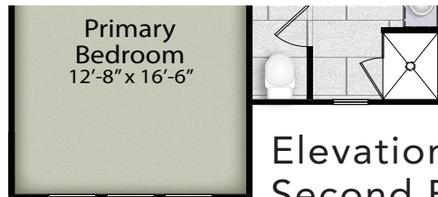
Elevation B Second Floor