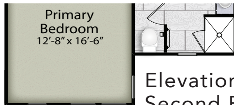
Elevation C Second Floor